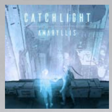
Sorti le 16.02.16 Sorti réédité le 11.07.18

«In a distant future, un disaster called the Long Night occurs and forces a part of humanity to exile itself underground in a city called Amaryllis led by an IA named EOS